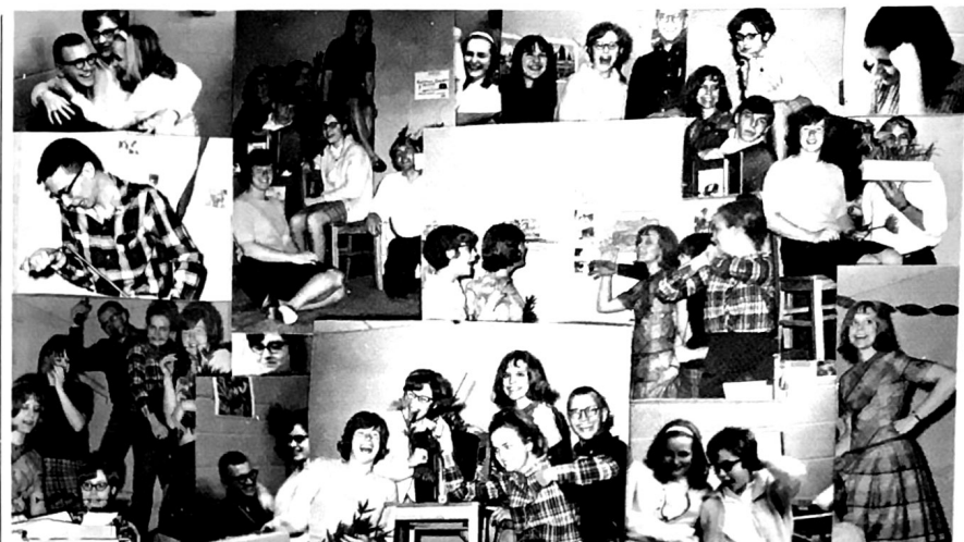
Our eager and competent staff is eagerly waiting to serve you

Please recognize this as a top effort from our staff, as it is better to give than to receive, or something like that; and a thing of beauty is a joy forever. Also, now one loves an albatross. There! That should just about fill this crocked-out page.