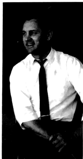
Mr. April Fool

classes should appreciate. Freshmen will be permitted to kiss senior rings, and if they are real good, they may be able to smoke the grass in the senior courtyard. Sophomores will be allowed to kiss senior hands, and to walk down the same side of the hall. Juniors will be allowed to kiss seniors, and to even talk to them. This is what is meant by "Senior Privileges."