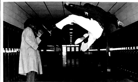
Need we say more?

Next year will prove to be an interesting year, and many GCM students will be eager to witness the marvelous metamorphosis about to take place. So, seniors, why worry about graduation? Come back next year and LIVE!!!